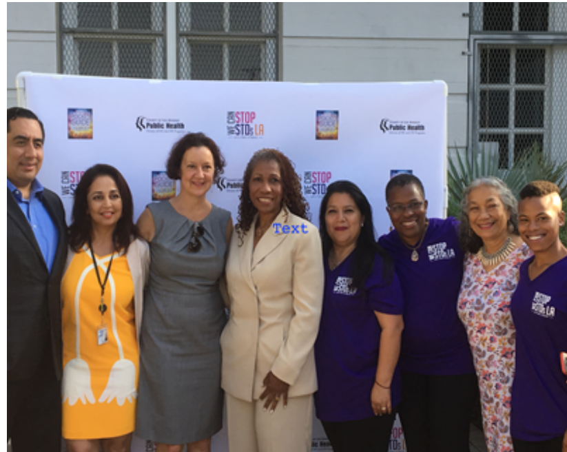
Youth and young adults in District 2 living healthy lifestyles in a thriving and supportive community

What strengths do faith communities have that would bolster a community health effort?