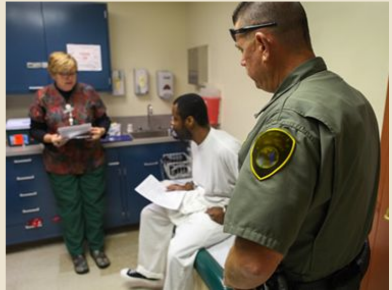
California Department of Corrections and Rehabilitation